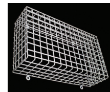
Wall Mount Wire Guard Part number: 2530050 Dimensions (mm) L x W x H 415 x 230 x 120